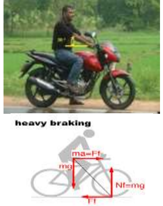
Figure: 1.2.Load acting over handle bar

Loading condition: Following figure shows the load applied by ride<u>r's hand over handle bar of a bike</u>.